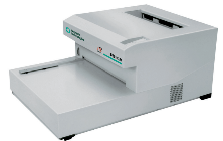
Film digitizer FS50B