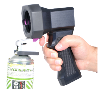
Spray can holder All MB PRO models are available with the Athena aerosol spray can holder. An application that releases one hand and MPI can be performed by one person.