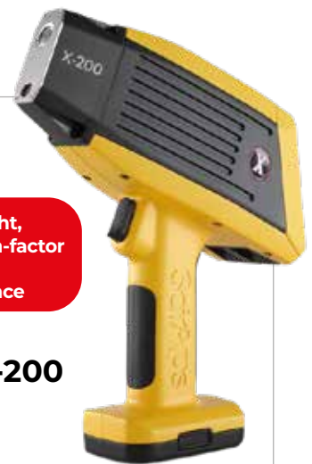
Lightweight, small form-factor and high performance

The X-550 sets a new performance standard for handheld XRF. Weighing 2.8 lbs. (1.3 kg) with the battery, it's the smallest, lightest, fastest XRF analyzer on the market . It's fast on all alloys and as good on aluminums as it is on high temps for the scrap market, and it comes with fully loaded apps for NDT (Residuals, Sulfidic Corrosion, Alloy).